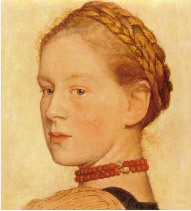
Die rote Halskette, 1942